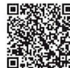
Taborton Zion Church Cemetery