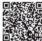
Sand Lake Union Cemetery